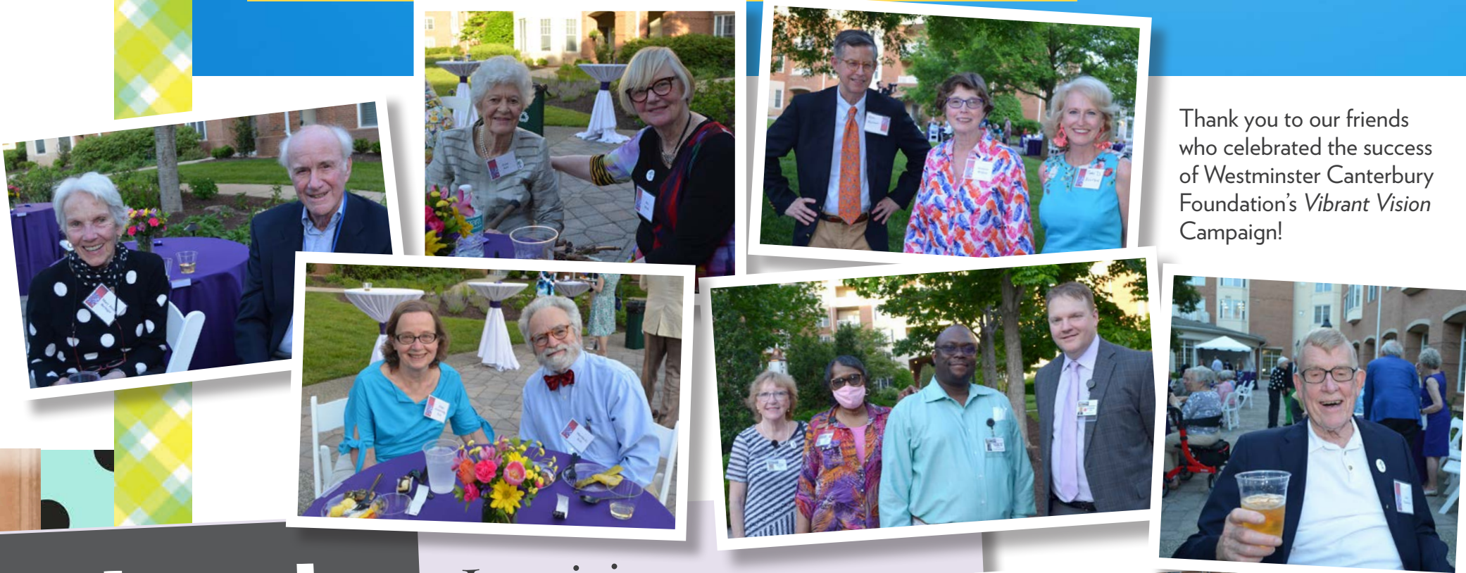
Thank you to our friends who celebrated the success of Westminster Canterbury Foundation's Vibrant Vision Campaign!