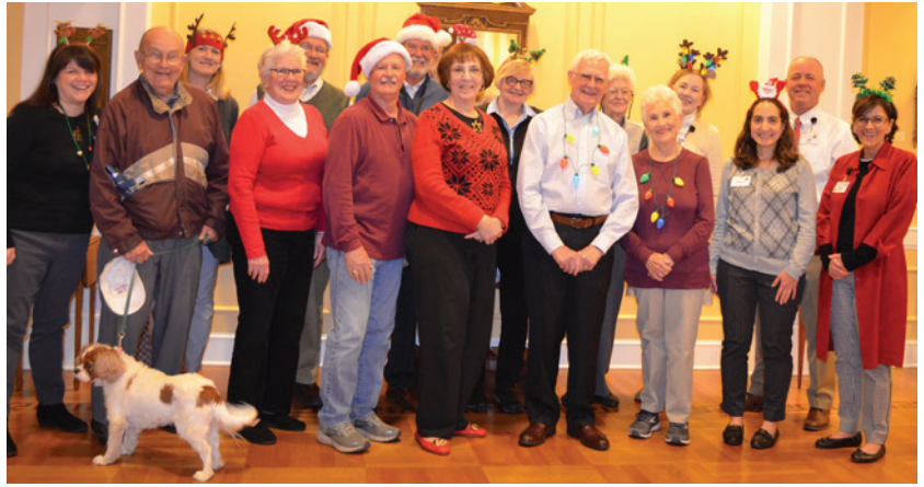
Westminster Canterbury Foundation's 2022 resident and staff Poinsettia Elves prepare to deliver gifts of appreciation to generous donors.